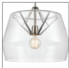
BN - Brushed Nickel