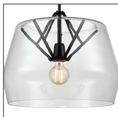
BK - Black