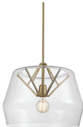
GD - Gold